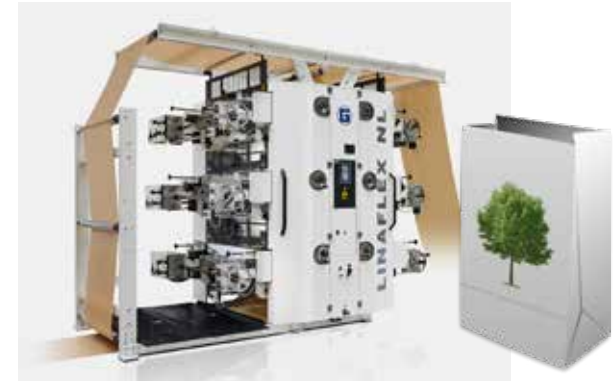
Inline printer LINAFLX NL