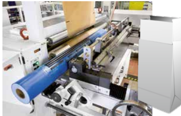
Feeding unit/cross pasting