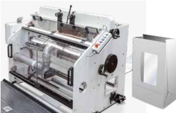
SERVO window die cut unit