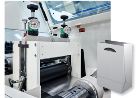
SERVO grip hole punching unit with reinforcement patch