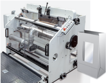
SERVO window die cut unit