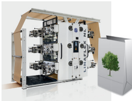
Inline printer LINAFLX NL