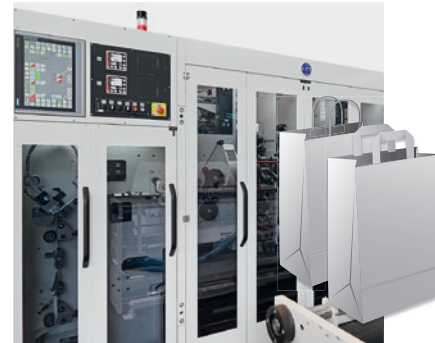
Flat or twisted handle unit