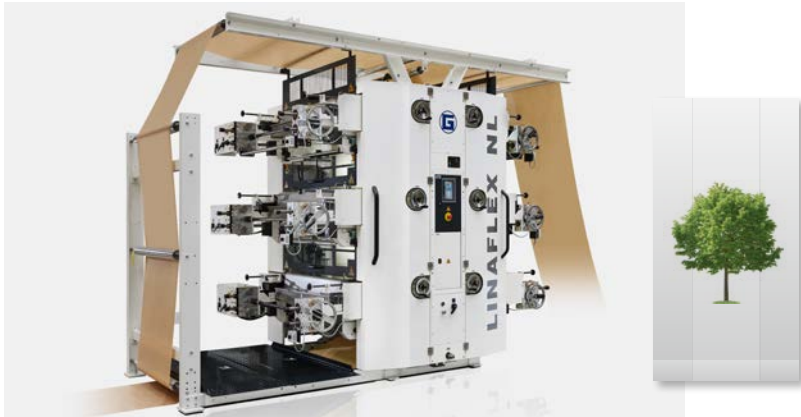
Inline printer LINAFLX NL